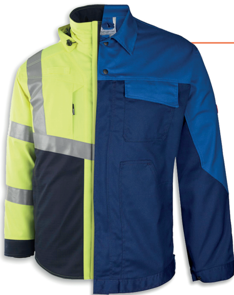
Protection Workwear Technical Workwear