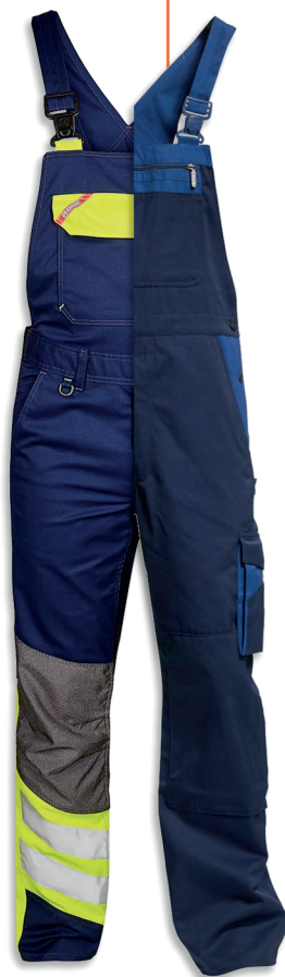
Protection Workwear Technical Workwear